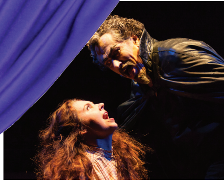
Actors Theatre of Louisville