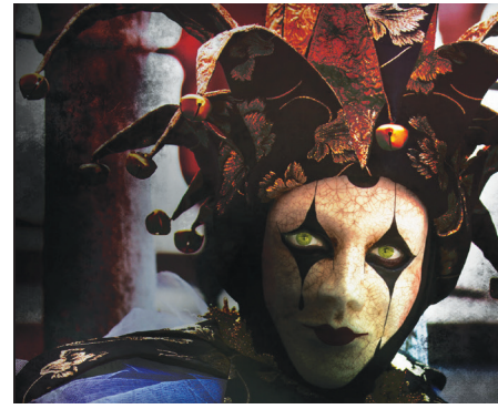
Plus Access to Kentucky Opera