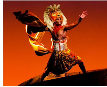
PNC Broadway in Louisville